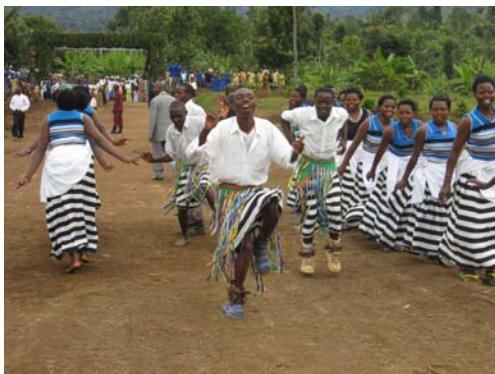
Villagers Celebrating Through Traditional Song and Dance