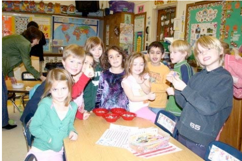
Glenwood Elementary Child Volunteers

( www.thelittlestvolunteers.org ) The book teaches children that volunteering helps kids develop compassion, empathy, generosity,