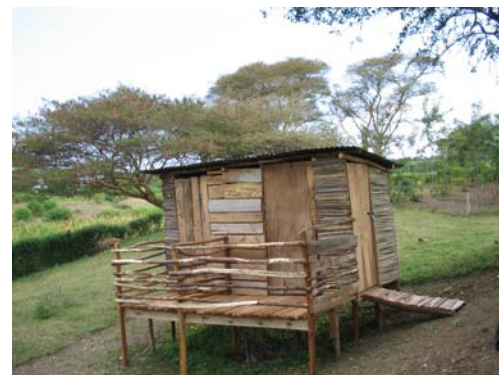
Newly Constructed Goat Shed; Prerequisite to Receiving a Goat

Kageno works to support and assist the small farmers in practical ways by helping the project beneficiaries to organize themselves into small groups called "clusters" that can support each other as they progress through the program. The project works by rotating the dairy goat offspring through each cluster, as one goat is given on contract to each cluster. The offspring then circulate among the cluster until all the families have at least one goat.