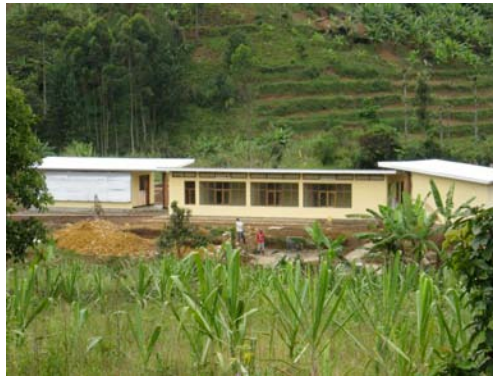
Banda Village Health Complex