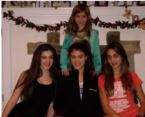
Short Hills New Jersey Kageno Kids

Special thanks to the Short Hills New Jersey Kageno Kids. The necklaces, bracelets and keychains they made, were sold at the November 3, 2008 Harambee Gala Event, where more than $3,000 was raised at Kageno's marketplace. Also sold at the marketplace were crafts and artwork made by the women and children of Rusinga Island.