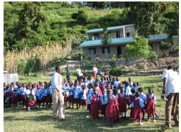
Kageno Mfangano Nursery School