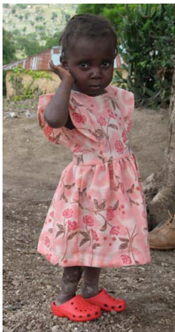
SolesUnited Crocs Recipient

SolesUnited, the U.S. based philanthropic arm of CROCS Inc., provided 10,000 pairs of shoes. The donation was overseen by Brothers Brother and shipping arrangements were made possible by U.K. based Pearson Publications in association with Cargo Services and Fordpointer.