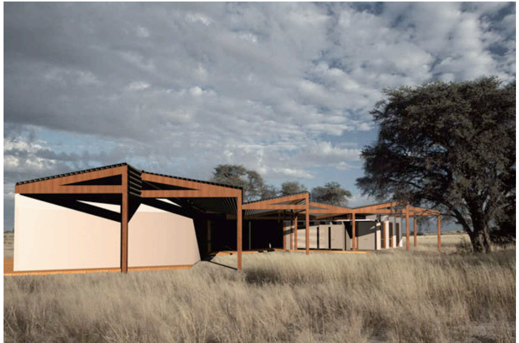
Architectural renderings of the proposed Eco-lodge

The project will include development of various eco-tourism activities in the village and construction of a high-end eco-lodge that will be entirely staffed by locals from Banda village. Designed by SPG Architects, an award winning architectural firm based in New York City, the proposed structure is a luxurious