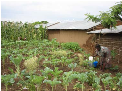
The Kageno Bio-intensive Agricultural program

Kageno in partnership with Floresta has started two very exciting programs; The Dairy Goat Program and Bio-intensive Agriculture program.