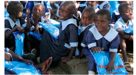
Kageno Kids with bed nets

U.N. and Kenyan officials have reported that child deaths from malaria have been reduced by more than 40 percent over five years by handing out the nets. This is a major advance at a very minimal cost. The price of a treated mosquito net averages US$ 4.00, and when properly used, reduces rates of severe malaria by an average of 45 percent and cuts childhood mortality rates by between 25 percent and 35 percent. Currently, however, less than 5% of children at greatest risk of the disease sleep safely under these nets.