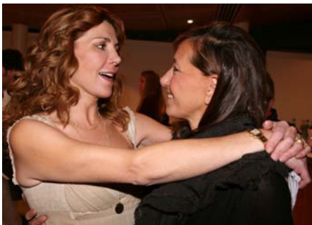
Natasha Richardson & Donna Karan

Natasha Richardson welcomed guests and spoke of her recent trip to Africa, sharing her personal experiences with Africa’s heart-breaking problems and her commitment to Kageno’s mission.