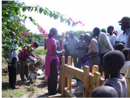
Briquette Machine Operation

Floresta has donated a briquette making machine and funded a training workshop. Informal waste collection is now being carried out on Rusinga Island. Dried organic waste products are separated out and sold to make fuel briquettes for domestic use. Given the economic and energy conditions on Rusinga Island, wastes remain a viable fuel alternative.