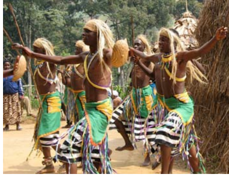
Traditional Rwandan Dancers

Another highlight involved a tour of a local doctor's medicinal garden, which helps to quell the poaching of plant life in the mountain forests that serve as a