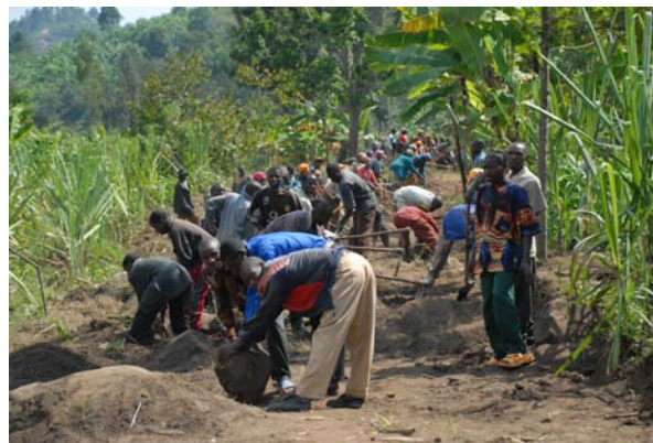
Villagers preparing the access road to the Kageno Rwanda compound Banda Village, Rwanda