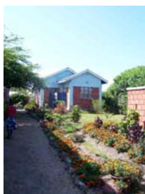
Kageno Nursery School

The Kageno Nursery School on Rusinga Island has a new look following a visit by 10 Board Members and donors in early July. The team landscaped and planted the school grounds with flowers and trees and gave the classrooms a bright new coat of paint.