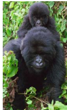
Susa Group Gorillas

We embarked on a couple of treks, a pastime that requires a guide to machete-cut paths on steep hills covered with stinging nettles and thick brush. Our first was to Nyungwe forest to see the chimpanzees, a hard group to follow. We encountered them along with many monkeys among the trees: golden,