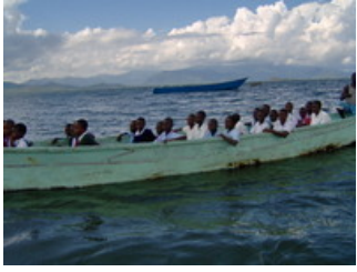
Children's Boat Ride

The Kageno Kids Art & Cultural Exchange Program organized a discovery trip to Bird's Island for 40 selected children from four local