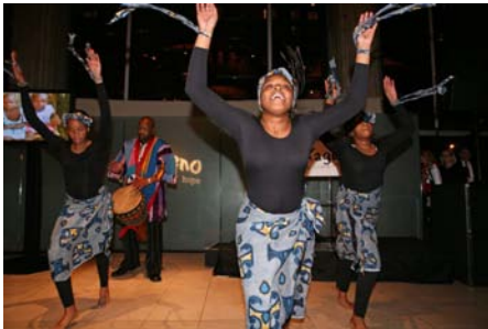
Children’s Storefront School Dancers

The evening began with a silent auction where attendees bid on a wide range of wonderful items including everything from Kageno Kids art, jewelry, health and beauty products to African safaris, works of art and spa treatments in Tuscany. The Children’s Storefront School then ushered guests to their seats with an enchanting African dance.