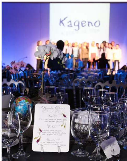
The Young Peoples Chorus taking the stage in the dining room