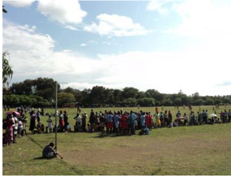
WAD Festivities, Football Tournaments

With the help of the International Medical Corps, 79 couples and 103 children were tested for HIV/AIDS.