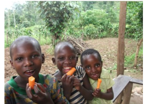
Carrots expanding the Banda feeding program

TFT provides funding for our school meals in Banda. This means daily meals for more than 350 children in the SL Nursery School and the extremely