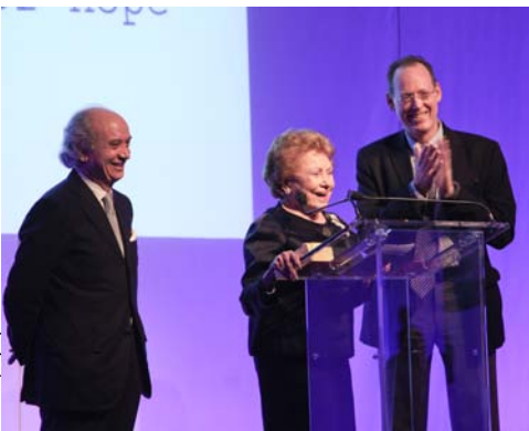
Lillian Vernon accepting her award from Dr. Paul Farmer