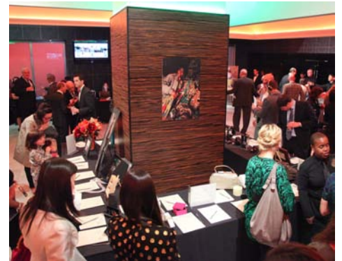
Cocktail reception and silent auction

The evening's theme was "Imagine". Together we celebrated what we had imagine and accomplished over the years and what we projects we imagine going forward. Through ticket sales, silent and live auctions, and the incredible generosity of our Kageno family, we raised nearly $300,000 dollars!