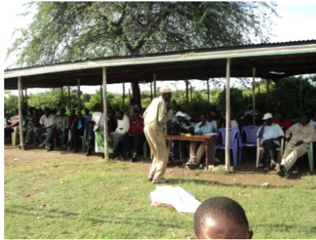
WAD's Energetic host addressing the crowd

Testing wasn't the only concern for WAD; efforts were also focused on minimizing the spread of AIDS. In 2007, the National Institutes of Health (NIH), one of the foremost medical research organizations, conducted randomized controlled trials