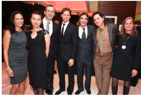
Our amazing Kageno board and volunteers

event not only possible but an outstanding success. We also send our heartfelt appreciation to everyone who attended the event or celebrated with us in solidarity. The projects that we imagine, are now achievable in 2012 because of the Harambee's success are this incredible support.